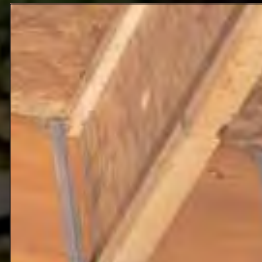
LP® SolidStart® I-Joists