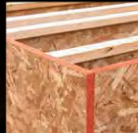
LP® SolidStart® Rim Board