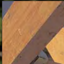
LP® SolidStart® Laminated Veneer Lumber (LVL)